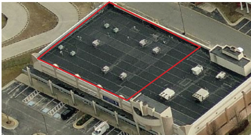
BUILDING 10 Central Park Blvd. Fredericksburg, VA 22401 SPACE 2 - 3,000 SF - 1311 Central Park Blvd. SPACE 4 - 1,005 SF - 1321 Central Park Blvd. SPACE 5 - 3,424 SF - 1325 Central Park Blvd.