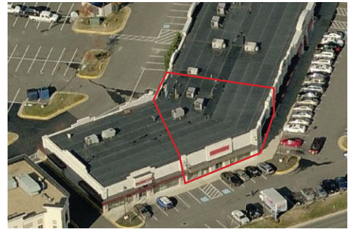
BUILDING 20 - SPACE 2 1460 Central Park Blvd. Fredericksburg, VA 22401 5,500 SF Retail