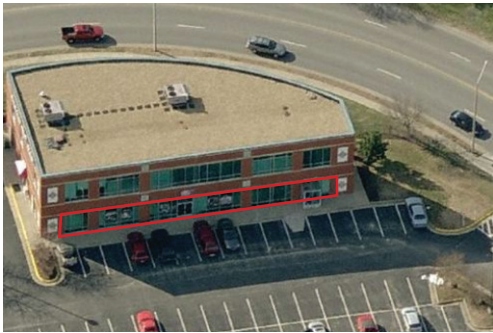
BUILDING 01 - SPACE 100 1171 Central Park Blvd. Fredericksburg, VA 22401 5,508 SF Office use